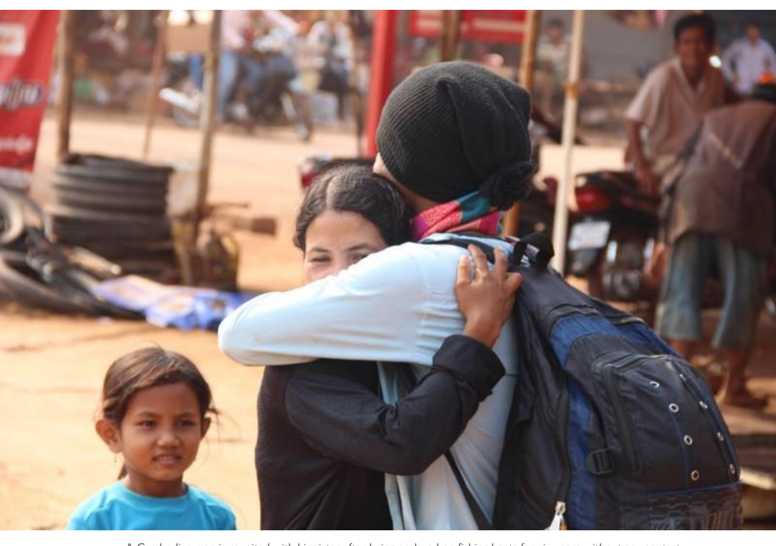
A Cambodian man is reunited with his sister after being enslaved on fishing boats for six years without any contact.