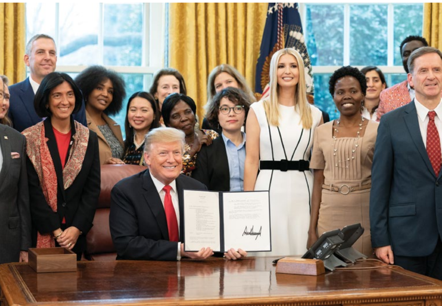
President Donald J. Trump signs a National Security Presidential Memorandum prioritizing global women's economic empowerment.