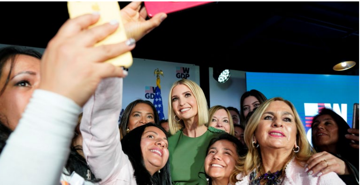
Advisor Ivanka Trump in Bogota, Colombia at the launch of the State Department's Academy for Women Entrepreneurs.

Among the first four country cohorts of AWE that graduated in summer/fall of 2019, highlights include: 100% of the respondents would recommend the Academy for Women Entrepreneurs to other women in their network; 97% of respondents already have or plan to implement items from their Business Plan developed during the training; and 53% of women plan to implement items from their action plan.