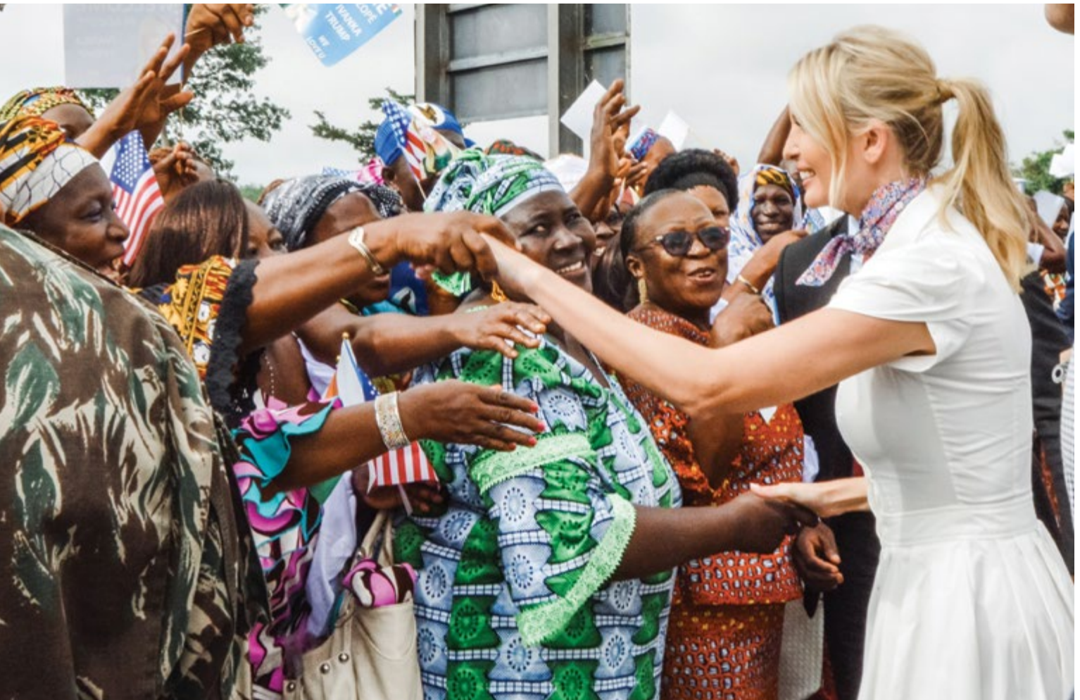
Advisor Ivanka Trump meets local women en route to the co-operative Cocoa Farm in Adzope, Cote d'Ivoire.