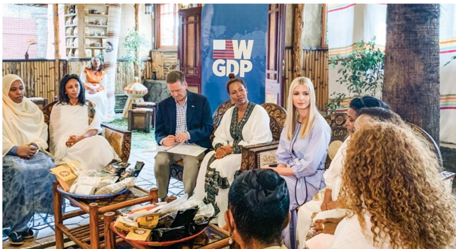
Advisor Ivanka Trump and USAID Administrator Mark Green met with female entrepreneurs in the coffee industry during their visit to Addis Ababa, Ethiopia.

*** Note that the State Department's FY 2017 allocation includes a one-time contribution of $50 million to the Women Entrepreneurs Finance Initiative (We-Fi), leading that fiscal year's attributed level to be atypically high.