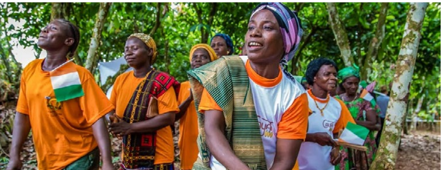
Women singing and dancing during the inaugural W-GDP trip to Cote d'Ivoire.

In the Initiative's first year, a number of impactful changes have occurred across the United States Government in furtherance of W-GDP, reinforcing this government-wide effort.