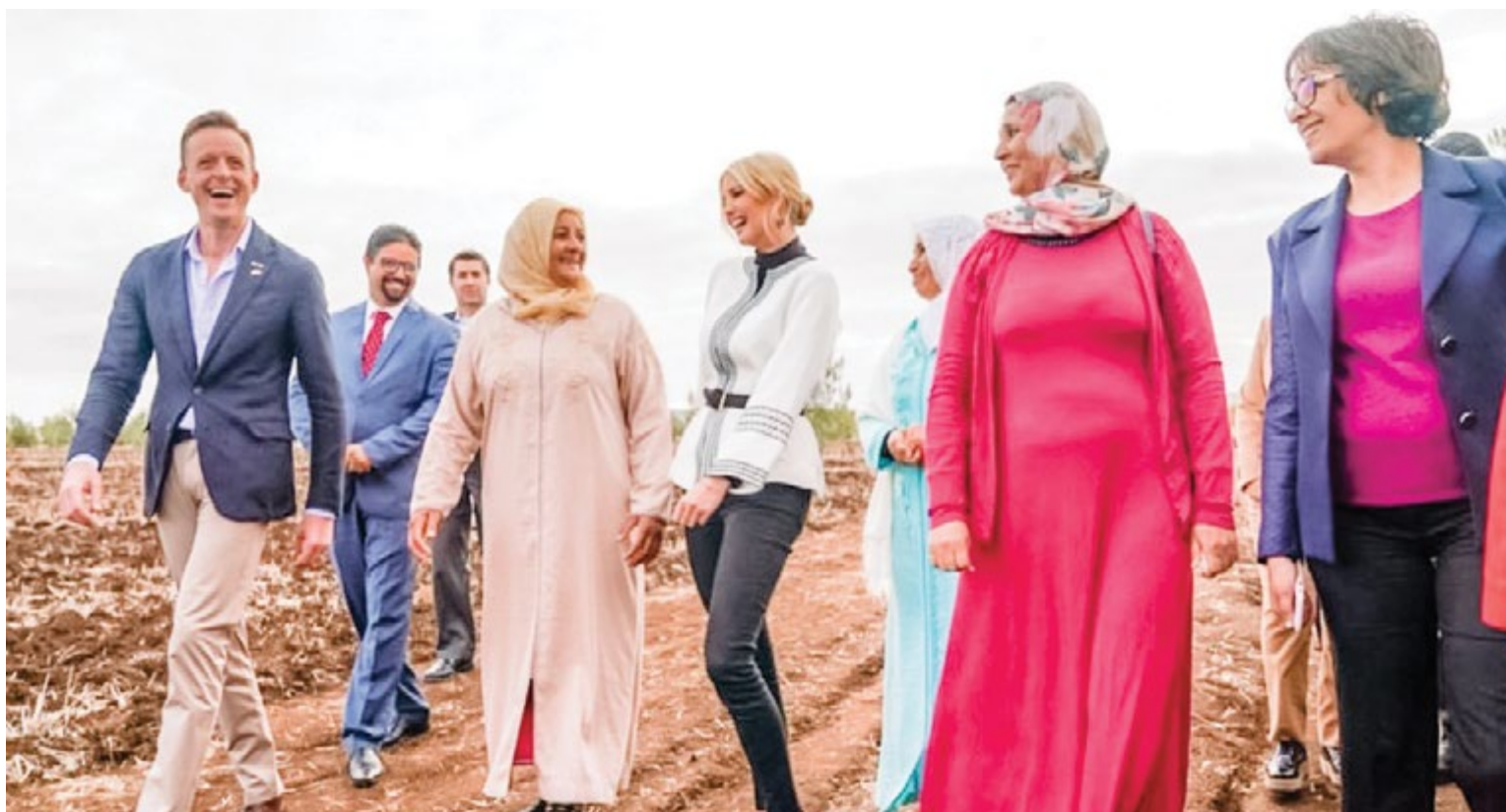
Advisor to the President Ivanka Trump and Millennium Challenge Corporation (MCC) CEO Sean Cairncross walk among Gharb region olive groves with four women beneficiaries of the MCC Compact.

As a part of Morocco's Employability and Land Compact with MCC , the Government of Morocco recently reformed legislation to revise the structure and administration of communal lands. Advisor Trump worked with the Government of Morocco to advance this priority, and celebrated the start of implementation during her visit to the country in November 2019. Land titling and inheritance rights are crucial to women's economic participation in Morocco. The MCC Morocco Compact is also supporting TVET centers that will train women and men in relevant skills demanded by the private sector and is providing career counseling to connect them with private firms that seek their expertise.