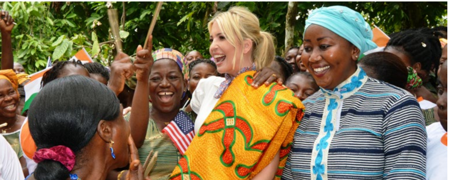
Advisor Trump with female cocoa farmers at the co-operative Cocoa Farm in Adzope, Cote d'Ivoire.

MCC has also expanded the Gender in the Economy Indicator on the MCC scorecard, the tool used to evaluate potential country partners. In 2019, MCC applied for the first time an expanded version of its Gender in the Economy indicator to country scorecards. Based on the World Bank's Women, Business and the Law data, the expanded Gender in the Economy indicator more fully incorporates key laws related to women's economic empowerment. Specifically, MCC went from counting 10 issue areas captured in the World Bank's Women, Business, and the Law dataset to 40. The Indicator now covers areas like gender-based violence, legal protections of women's inheritance and ownership of property, and job restrictions for women.