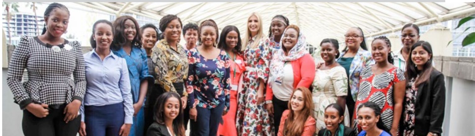
Advisor Ivanka Trump with YALI women prior to the 2X event hosted in Addis Ababa, Ethiopia.

**DFC estimates women reached based on a five-year time horizon for projects committed to within a given fiscal year, which have been spread evenly across the years for the purposes of this Report.