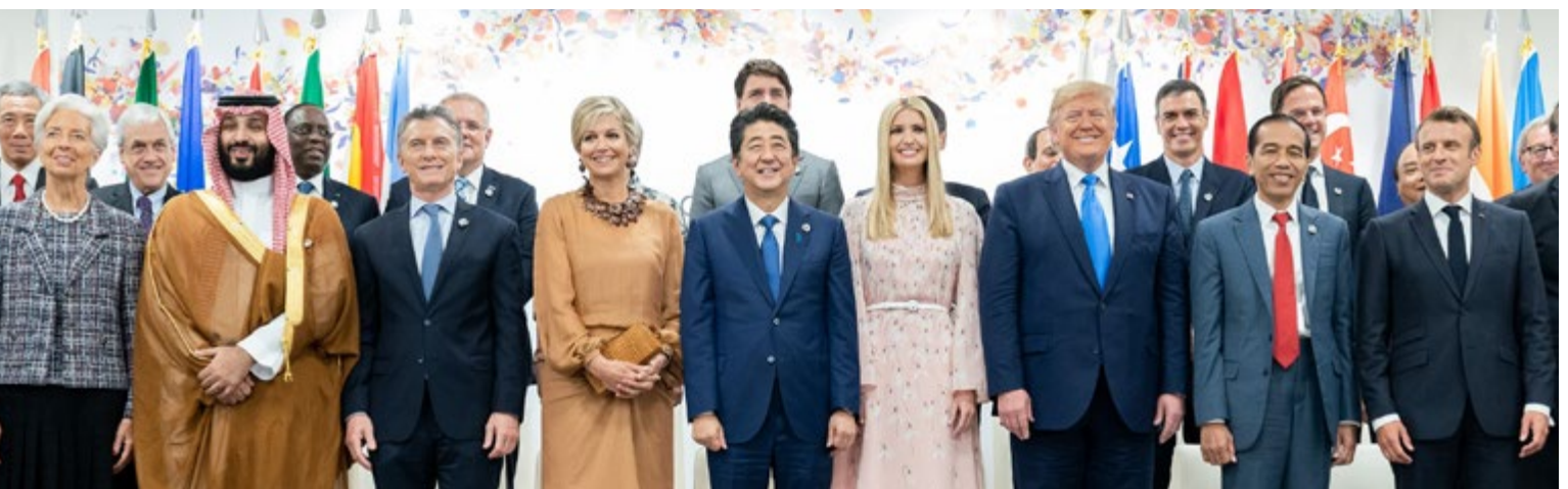
Prime Minister Abe, Queen Maxima, and Advisor Ivanka Trump addressed world leaders at the G20 in Osaka, Japan on the economic and national security imperative of economically empowering women globally.