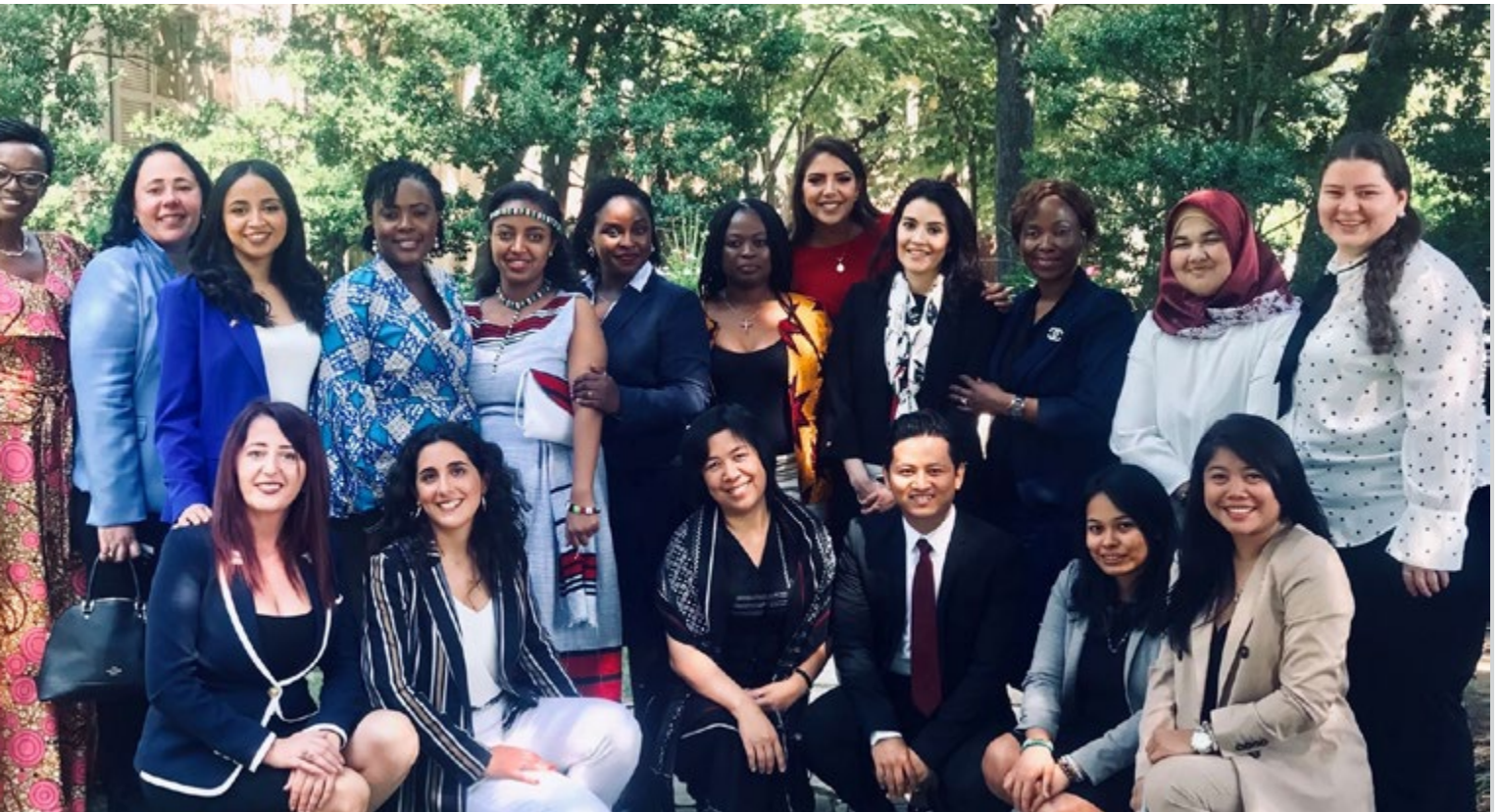
The inaugural W-GDP International Visitors Leadership Program (IVLP) participants at Meridian International in Washington, DC.