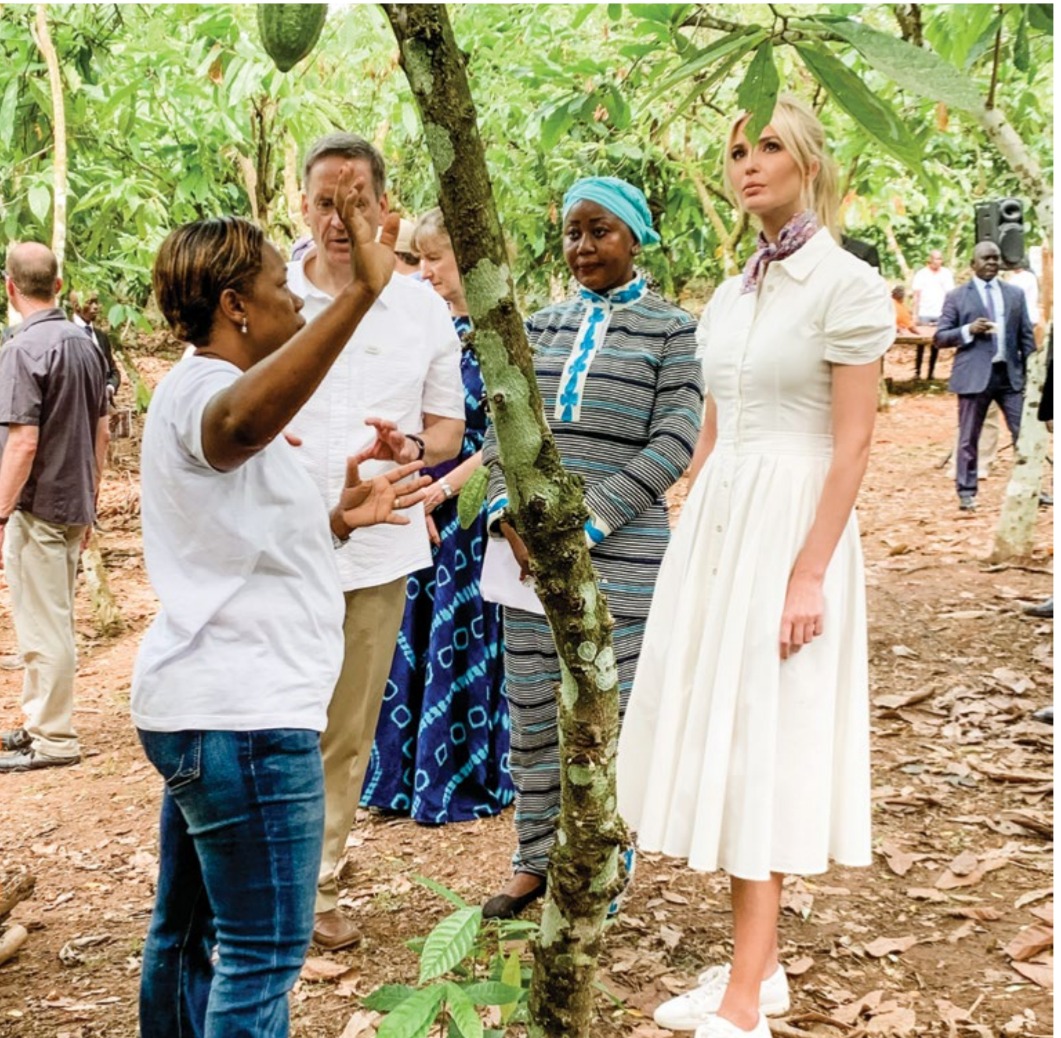
USAID Administrator Mark Green and Advisor Ivanka Trump visiting a co-operative Cocoa Farm in Cote d'Ivoire.