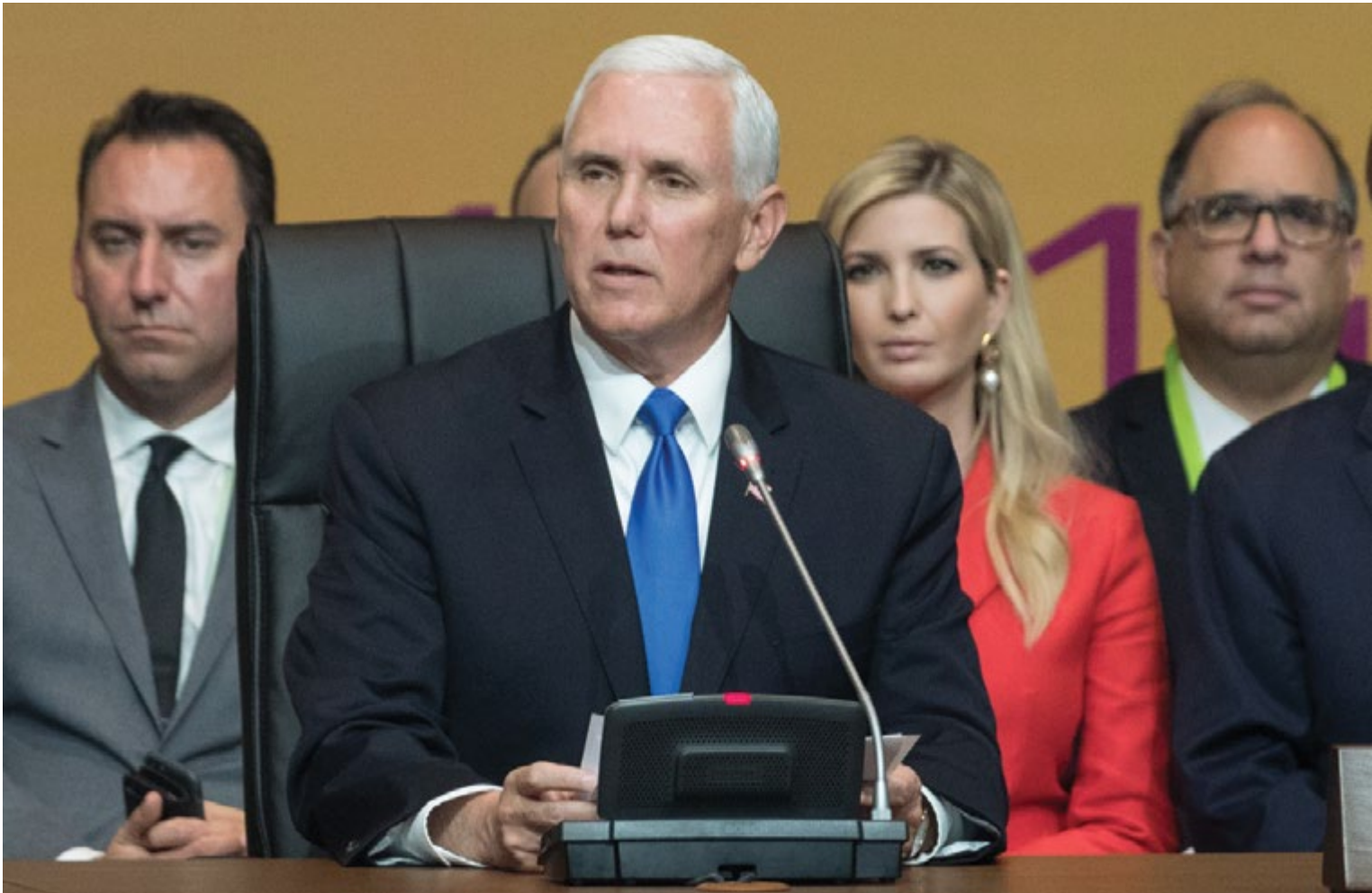
Vice President Mike Pence and Advisor Ivanka Trump attended the Summit of the Americas in Lima, Peru to help advance women's economic participation globally.

Beyond the W-GDP Fund and across the broader U.S. Government, significant changes are underway among departments and agencies, including: