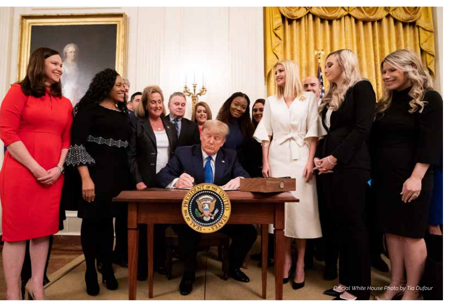
President Donald J. Trump signs an Executive Order on Combating Human Trafficking and Online Child Exploitation in the United States, at the White House Summit on Human Trafficking on January 31, 2020.

PRESIDENT DONALD J. TRUMP EXECUTIVE ORDER ON COMBATING HUMAN TRAFFICKING AND ONLINE CHILD EXPLOITATION IN THE UNITED STATES JANUARY 31, 2020