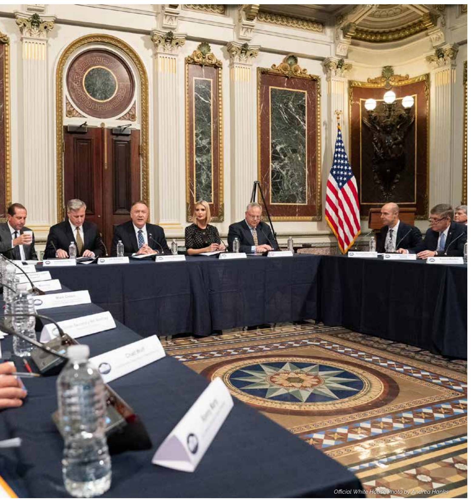
Meeting of the President's Interagency Task Force to Monitor and Combat Trafficking in Persons on October 29, 2019.