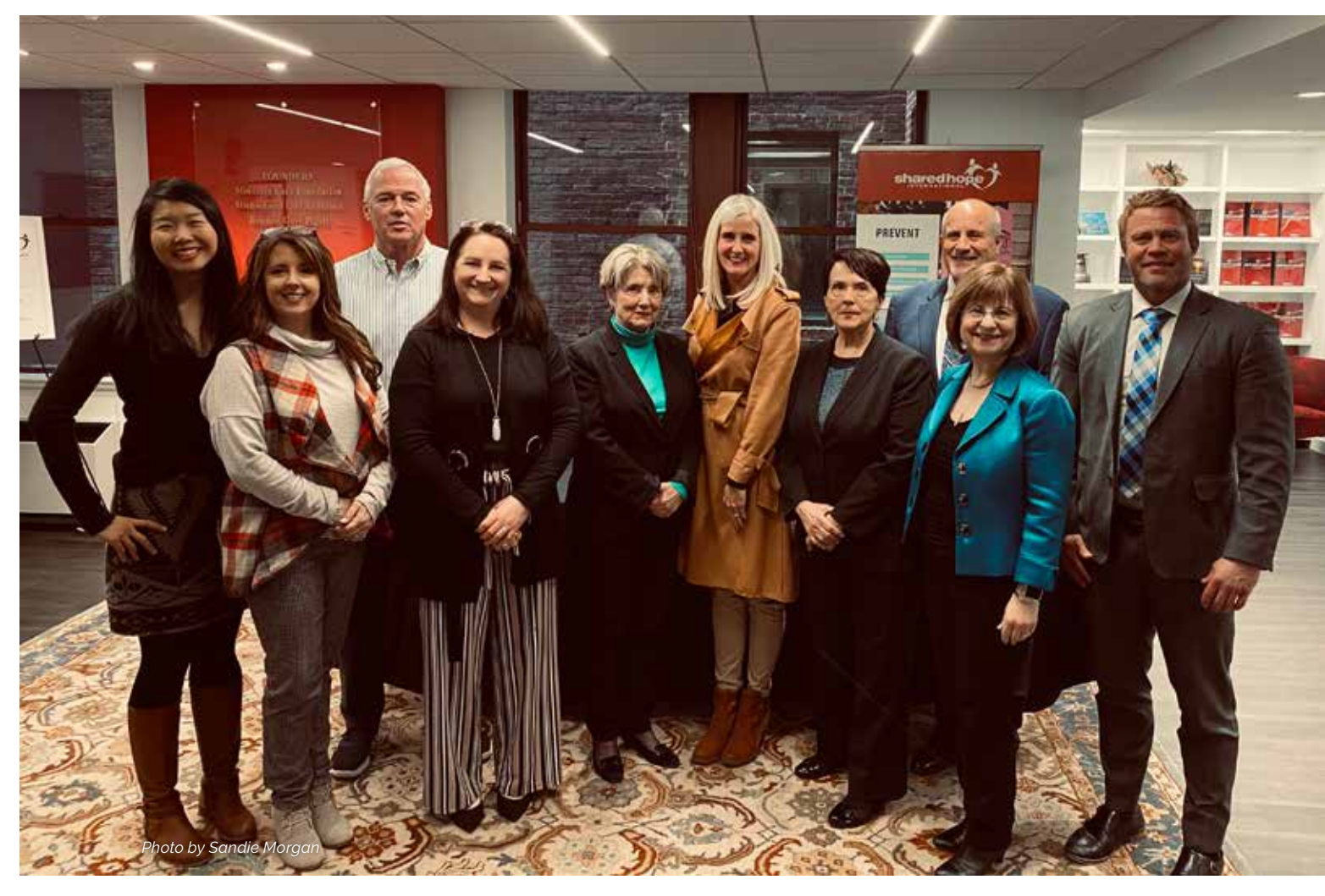
Members of the Public-Private Partnership Advisory Council to End Human Trafficking

We are confident that our recommendations represent a significant and important part of the private sector's contribution to ending human trafficking in the United States and globally."