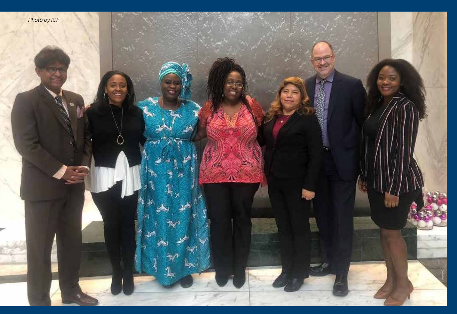
Members of the U.S. Advisory Council on Human Trafficking

2020 ANNUAL REPORT U.S. ADVISORY COUNCIL ON HUMAN TRAFFICKING